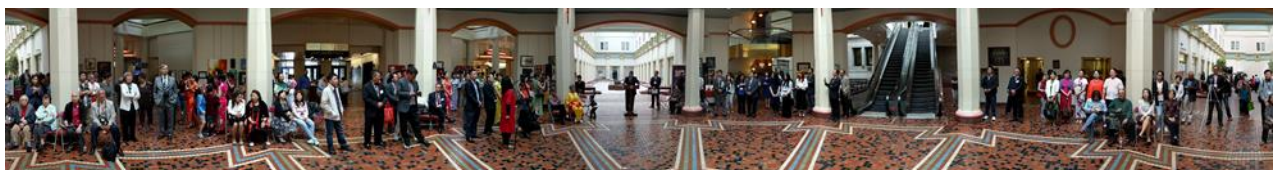
Panorama View of the East Wing