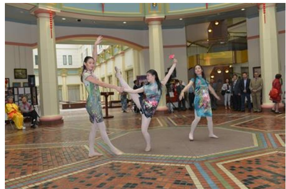
Classic Chinese Dance by Little Star Chinese Language School