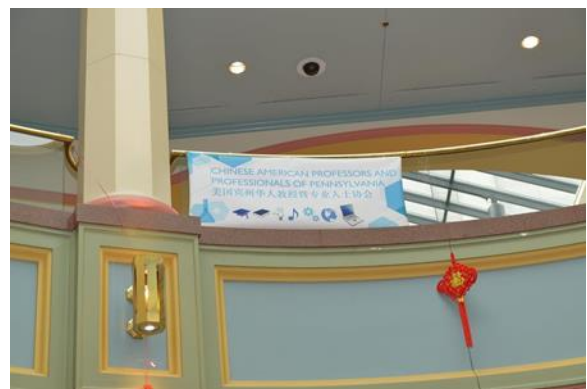
CAP Banner Display