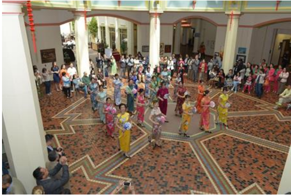
Qipao Show by Sunshine Dance Club & CPCA

Chinese American Professors and Professionals of Pennsylvania