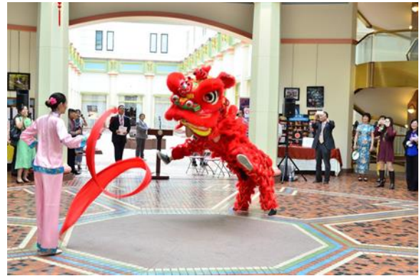
Chinese Lion Dance by Little Star Chinese Language School