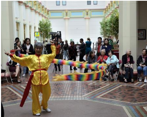
Yo-Yo Show by CPCA

More event photos and videos can be viewed: