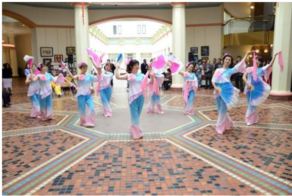
Classic Chinese Dance by Sunshine Dance Club & CPCA