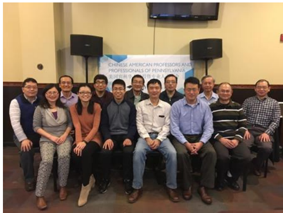
CAP Gathering at the January 2017 Meeting