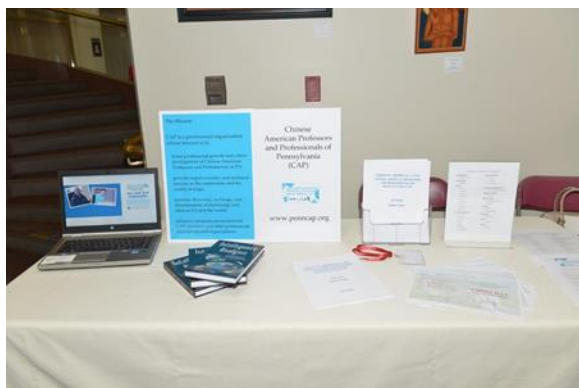
CAP Booth Display